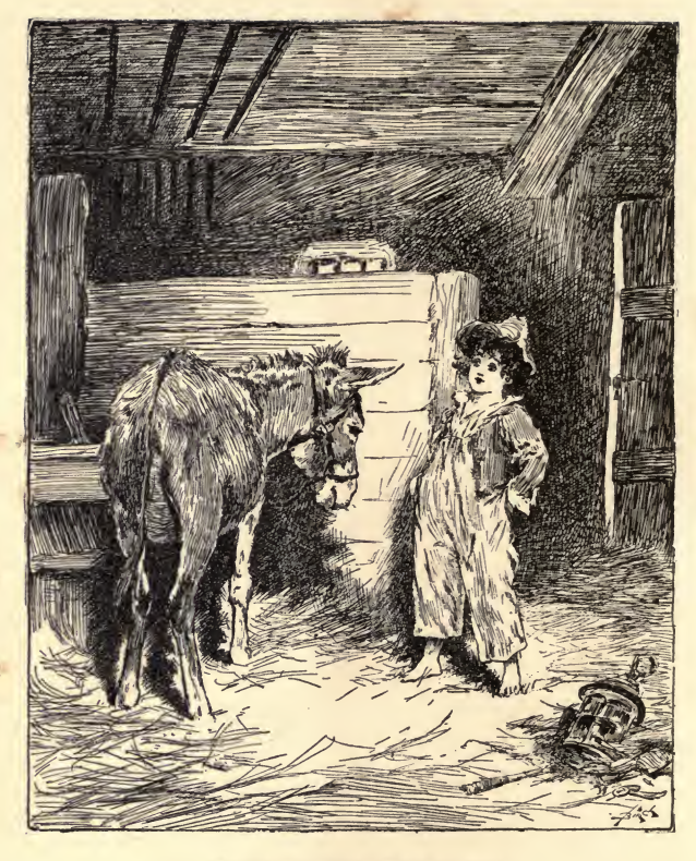
"SO HE WENT TO SHOW IT HIS TROUSERS"